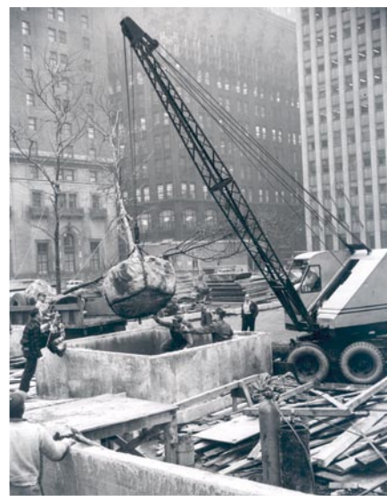
Mellon Square tree planting